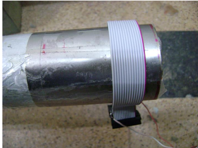
Fig 3. Flat flexible cables placed over the pipe sensor ribbon element.

A typical Flat Flexible cable FFC for generating AC/DC field is shown in fig-3. The coils/cables may also be made of flexible Printed Circuit board. It is expected that the three coils TC, Bc and Rc will be on same flexible cables.